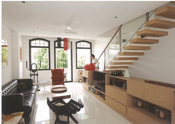
Second storey transformed into family living area