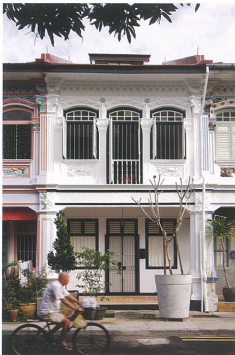
Late shophouse-style residential terrace restored

Behind the traditional façade of the restored building are interior spaces that have been boldly reinvented. Adhering to the owner's brief, the architects followed through on the idea of reversing the common living areas of the house. The master bedroom, typically on the second storey, was relocated to the ground level while the living room and kitchen were moved upstairs.