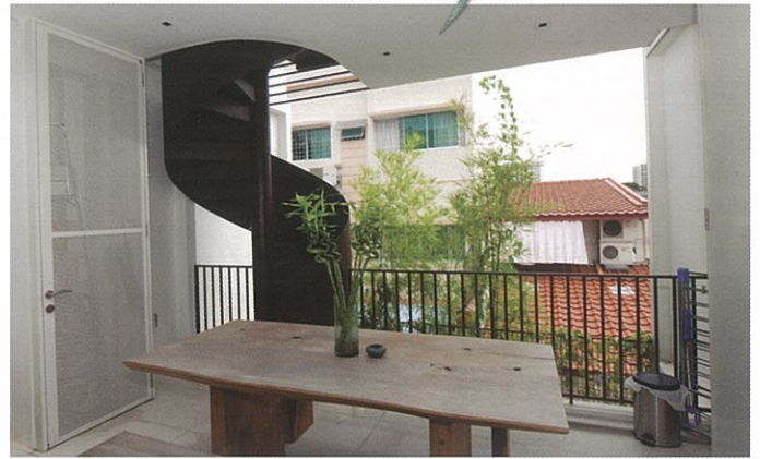
Outdoor balcony with spiral staircase reminiscent of an old shophouse