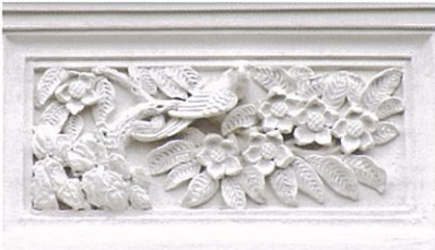
Decorative panel below second storey window