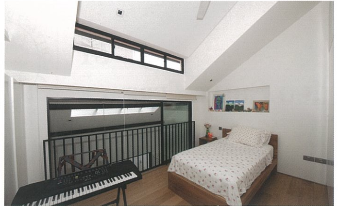
Attic bedroom naturally lit