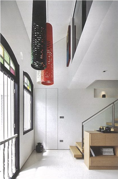
Attic set back to maintain spacial quality