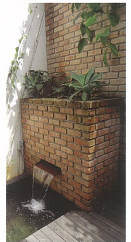
Rear garden at first storey