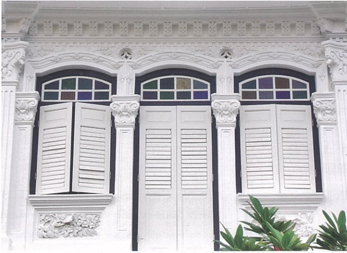
Ornate second storey front façade