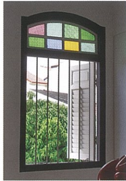
Fanlight with textured colour glass